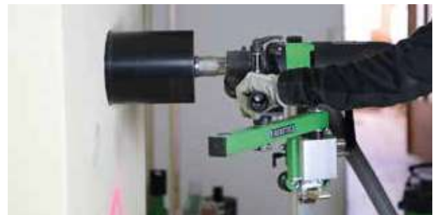
Core drilling for the chimney connection

Elektrowerkzeuge GmbH Eibenstock Auersbergstraße 10 08309 Eibenstock